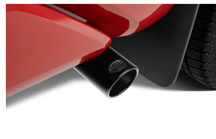
Exhaust Tip - Black Chrome $165.00

The Toyota Genuine Dash Camera is designed to provide a safe and memorable driving experience in your Toyota vehicle. Safely record the on-goings of the open road while keeping your eyes on the road. Never miss a moment in motion; capture it! The Toyota Genuine Dash Camera will also allow you to record the surroundings of your vehicle while it is parked.