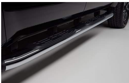
Side Step Bars - 5-inch Chrome $977.50

Gain easy access into your Tundra while enhancing the exterior appearance. These durable and robust 5-inch Side Step Bars feature dual-moulded, skid-resistant step pads and come in a brilliant chrome finish. Not only does the chrome finish look great, it also provides protection against the elements.