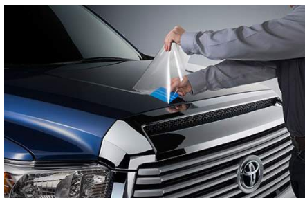
Pro Series Paint Protection Film $450.00

This custom-designed Block Heater not only warms your vehicle up quicker, but also reduces engine strain and wear. The system also helps to save fuel and battery power during startups, and the strain relief electrical cord reduces cord damage.