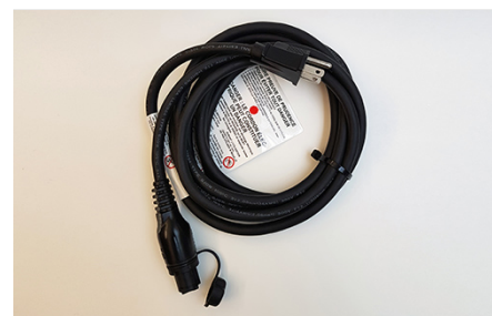
Premium Plug-In Block Heater - Optional 10m Home Power Cable $100.00

Optional 5.0m Home Power Cable. This cable can be purchased instead of or in addition to the standard 2.5m Home Power Cable (PK5A4-89J40)