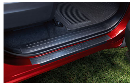
Kit: Door Sill Protectors (front and rear) $142.50

Toyota START+ long range remote engine starter enables you to start your Toyota from 800 meters or 2,600 feet away (unobstructed). Toyota START+ activates your pre-set heating and air conditioning system, as well as your front and rear defoggers. Non-Genuine remote engine starters and any damages or failures resulting from installation and use, are not covered by any Toyota warranty. Only the Genuine Toyota START+, is covered by Toyota warranty. All Non-Genuine remote engine starter installation is hostile and requires cutting, splicing and soldering of wires and/or require an additional immobilizer bypass device. All features may not be applicable to all vehicle models.