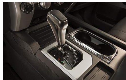
TRD Shift Knob $192.50

Enhances Tundra's tough, capable stance and helps protect vehicle underbody from damage that can result from flying stones, salt, branches, ice chunks, and other types of road debris. Made from stamped and formed 1/4-in.-thick silver powder-coated aluminum.