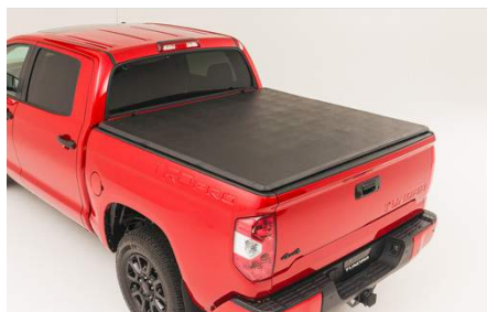
Soft Tri-Fold Tonneau Cover $837.50

Manufactured from forged, highly polished billet aluminum, the TRD Oil Cap features a red on black TRD logo to customize the engine compartment with a high-tech, race-inspired appearance. It's finished with a high-luster coating to maintain its appearance for years to come.