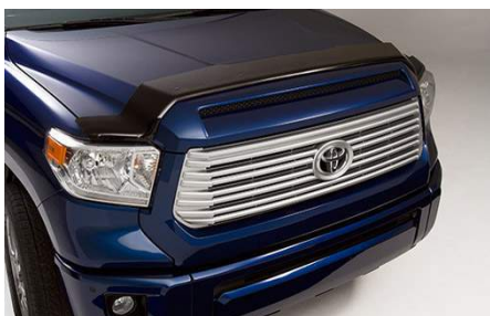
Hood Deflector $237.50

Protect your Tundra's bed when you need it. Custom designed for an exact fit, the Bed Mat protects against scratches, spills, and damage. Made from thick cord-reinforced, synthetic rubber for durability, the Bed Mat is resistant to cracking and breaking while providing airflow and drainage to keep the Tundra's bed dry. The anti-slip design also prevents items from sliding around in the bed area.