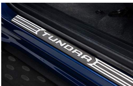
Door Sill Protectors $302.00

The Door Sill Protectors help guard against scuffs and scratches. Not only are they functional, but they also provide a styling accent that is immediately noticed when entering the vehicle. Kit of 4 (front and rear).