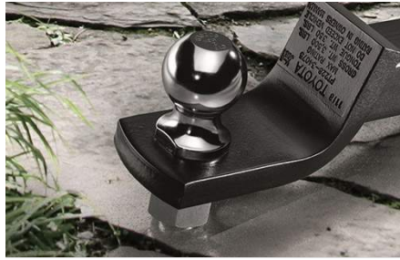
Towing Hitch Ball - 2" - 6,000 lbs $34.50

Feed your engine some cooler air with the TRD Cold Air Intake! • Designed to work with factory ECU and emissions system • Features washable and reusable TRD high-flow air filter • Maintains high Toyota quality standards for durability and strength