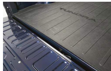
Bed Mat $166.50

Guard your vehicle from weathering, UV radiation and road debris that can chip and scratch the finish with 3M Pro Series Genuine Toyota Paint Protection Film. This durable and nearly invisible thermoplastic urethane is designed to protect the hood and front fenders to maintain a like-new appearance.