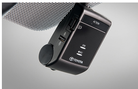
Toyota Genuine Dash Camera $698.50

Made from thick high-grade tinted acrylic, the Hood Deflector offers high impact resistance and reduces the potential damage to your hood from road debris. The stylish wraparound design complements the vehicle's appearance while providing extra side protection.