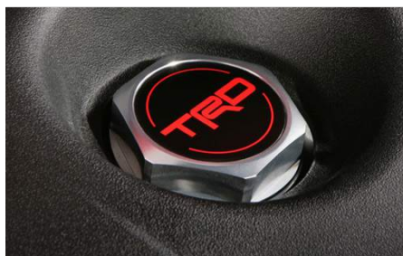
TRD Forged Aluminum Oil Cap $87.50

Enhance your connection to your Tundra every time you shift with the TRD Shift Knob. Delivers an enhanced shifting feel while providing an impressive addition to your interior.