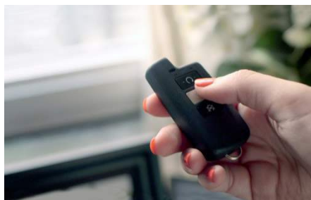
START+ Long Range Remote Engine Starter $1,089.95

Gain easy access into your Tundra while enhancing the exterior appearance. These durable and robust 5-inch Side Step Bars feature dual-moulded, skid-resistant step pads and come in a brilliant chrome finish. Not only does the chrome finish look great, it also provides protection against the elements.