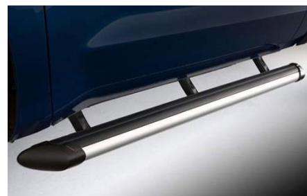
Side Step Bars - 4-inch Aluminum $820.00

The soft tri-fold tonneau cover gives your truck added versatility. Designed and engineered specifically for your Tundra, this low-profile soft tonneau cover is made from lightweight aluminum and the highest-grade vinyl in the industry. Backed by a factory 3-year/60,000km New Vehicle Limited Warranty, and can be incorporated into your vehicle payments.