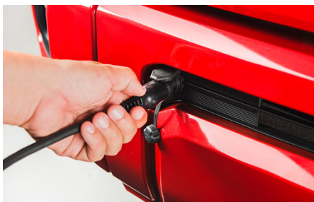
Premium Plug-In Block Heater $457.50

This custom-designed Block Heater not only warms your vehicle up quicker, but also reduces engine strain and wear. The system also helps to save fuel and battery power during startups, and the strain relief electrical cord reduces cord damage.