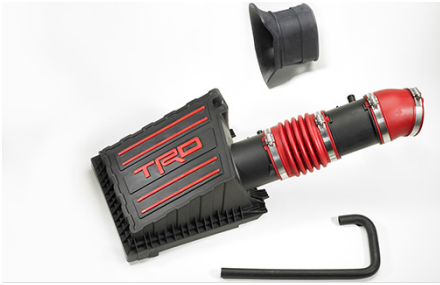
TRD Performance Air Intake System $612.50

Feed your engine some cooler air with the TRD Cold Air Intake! • Designed to work with factory ECU and emissions system • Features washable and reusable TRD high-flow air filter • Maintains high Toyota quality standards for durability and strength