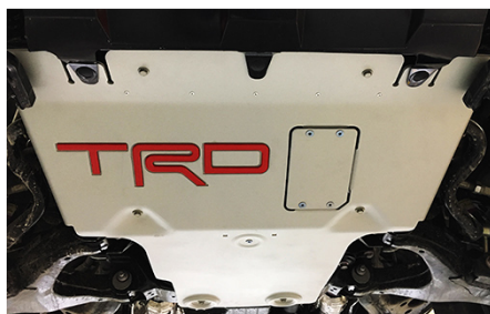
TRD Front Skid Plate $770.00

Keep your oil pure as long as possible, and help enhance the life of your engine, with the TRD Oil Filter that kicks out impurities through a 100% synthetic fiber filtration medium.