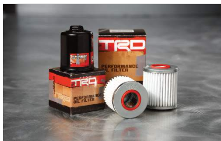
TRD Performance Oil Filter $107.50

Keep your oil pure as long as possible, and help enhance the life of your engine, with the TRD Oil Filter that kicks out impurities through a 100% synthetic fiber filtration medium.