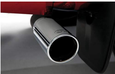
Stainless Steel Exhaust Tip $110.00

The Towing Hitch Ball is designed and tested to meet your Tundra's towing specification and quality standards.